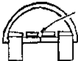
Snow Shield (Front View)