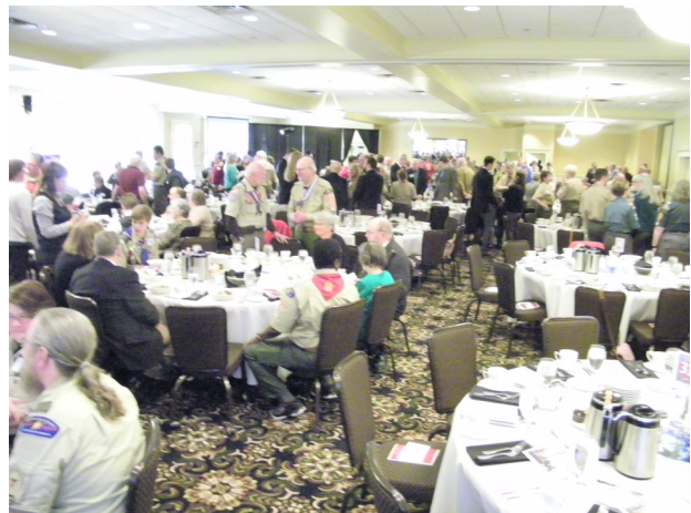
The Council Recognition Dinner was held at the Golden Valley Golf and Country Club