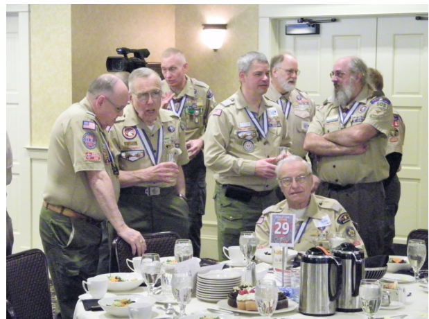
Scouters gather for fellowship prior to dinner