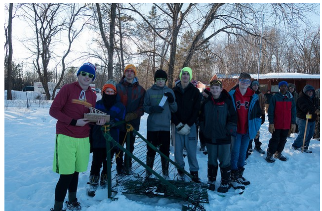
Survivors with their Klondike sled award!