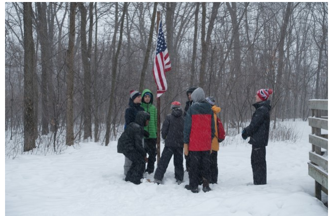
Raising the colors at Klondike Derby