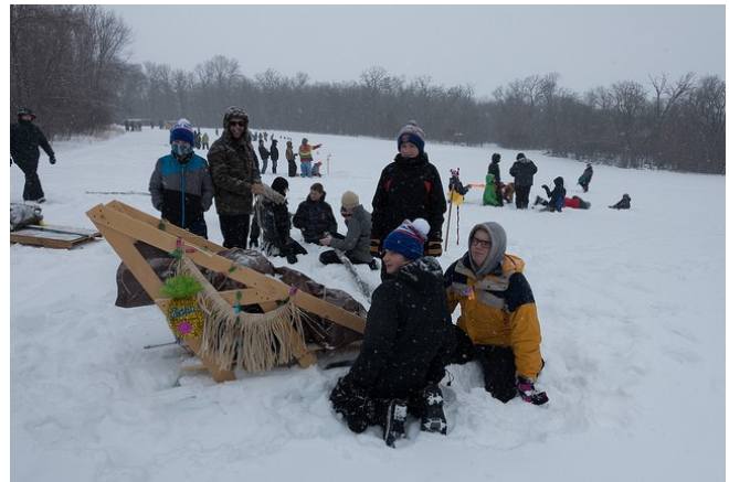
Klondike Derby Sled with an Hawaiian appeal